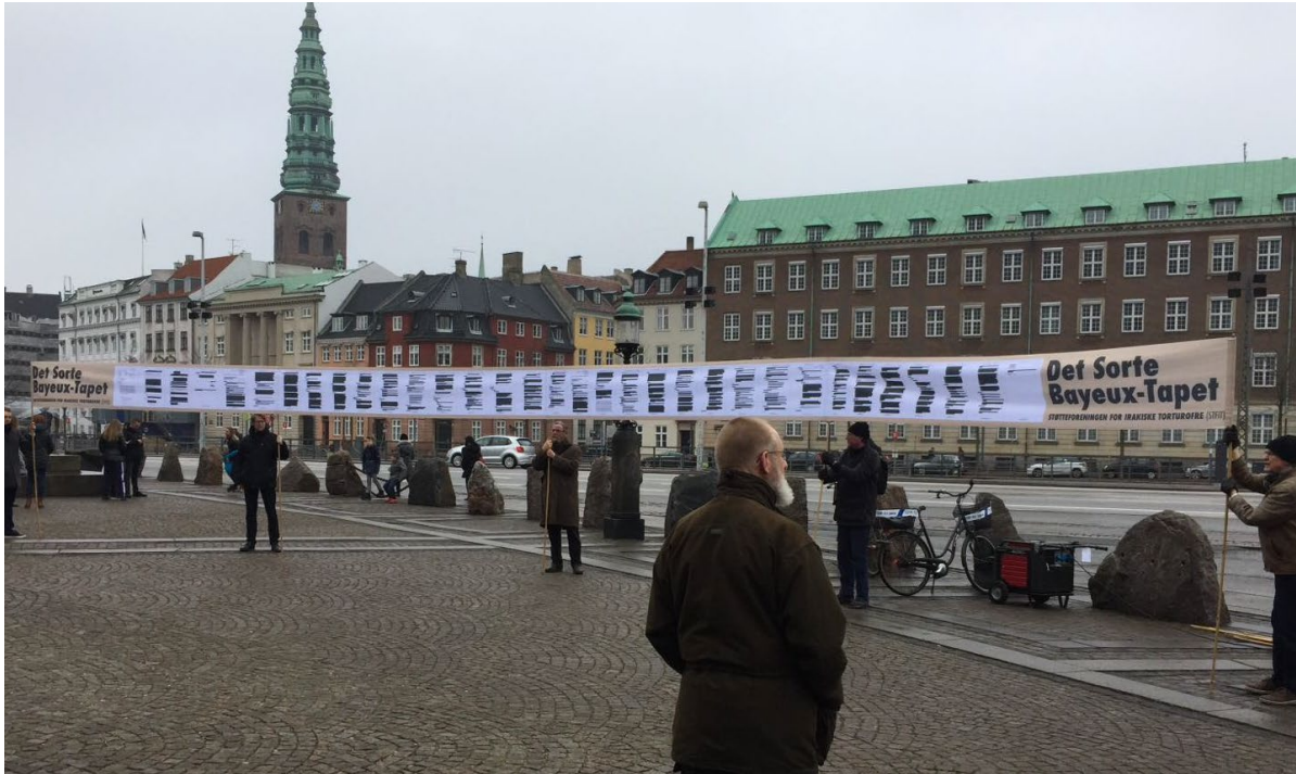
The document CÅ in exhibition as a poster in front of the Danish Ministry of Defence, satirically referred to as 'The Black Bayeux Tapestry'

Furthermore, exhibit FT in the national court cases is attached as exhibit GC8.